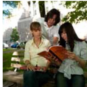
Study in a sociable atmosphere