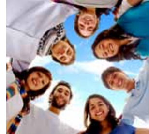
Make new friends