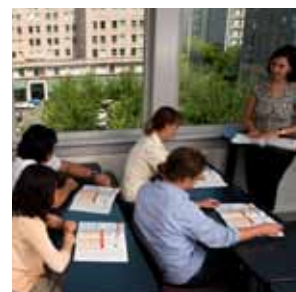
A classroom at Kaplan's Portland Center