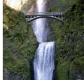
Enjoy the beautiful scenery in Oregon

Public telephones can be found throughout the downtown area and wireless internet is widely available. Computer stations can be used at the nearby public library.