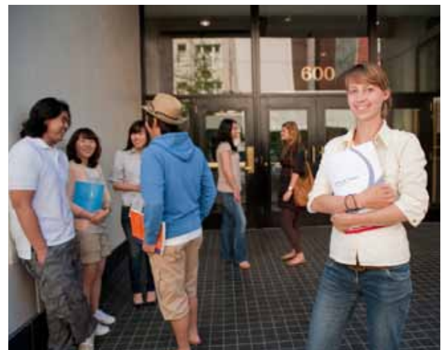
Kaplan Center Entrance