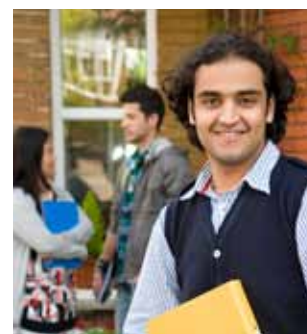
Kaplan students outside the college