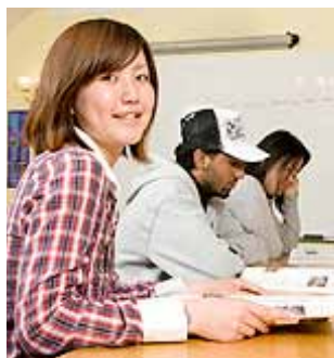
Kaplan students in the classroom