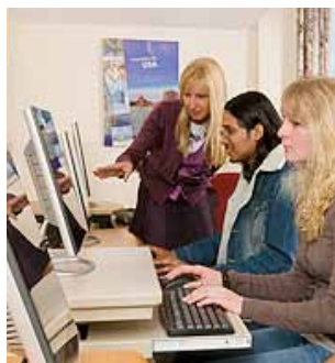
College IT Centre

A full and varied social programme is organised each week. Please see overleaf for an example timetable.