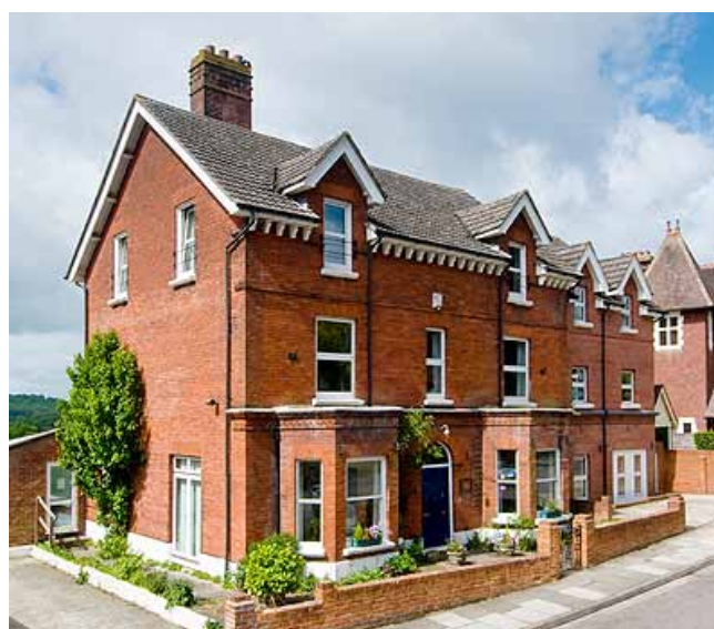
Kaplan International College in Salisbury

Our college is situated in an elegant Victorian building ideally located five minutes away from the city centre. Students can make use of the free e-mail and Internet facilities, or relax in the large garden with sun terrace and enjoy a game of table tennis overlooking the cathedral. There is a common room with vending machines selling drinks and snacks, and delicious freshly made rolls are available daily.