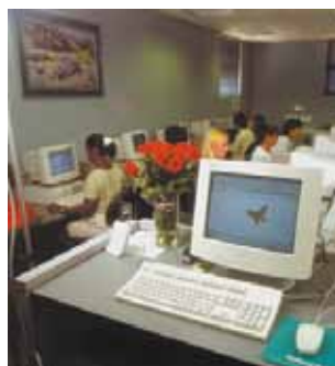
Kaplan multimedia room

Kaplan arranges a full schedule of excursions and activities that may include weekend trips to Las Vegas, San Francisco and Yosemite. There are also trips to Universal Studios, Disneyland and the local vineyards.