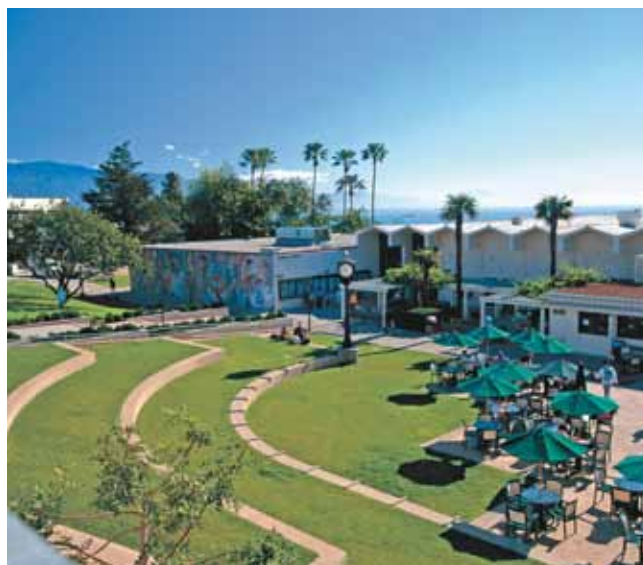
Santa Barbara City College campus

If arriving at Santa Barbara Airport, you can take a taxi to your homestay, for $20- $40. If arriving at Los Angeles International Airport, you can book the Santa Barbara Airbus ( www.sbairbus.com ) for $42 one-way, and then take a taxi from the bus stop to your homestay (approximately $20-$40).