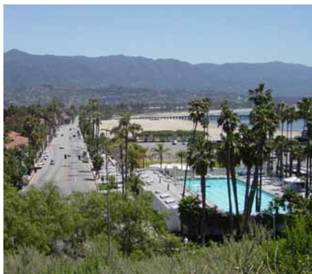
Santa Barbara City College