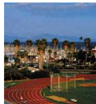
SBCC running track