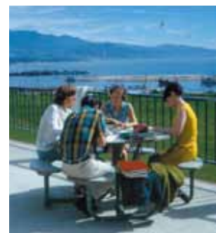
View from SBCC balcony