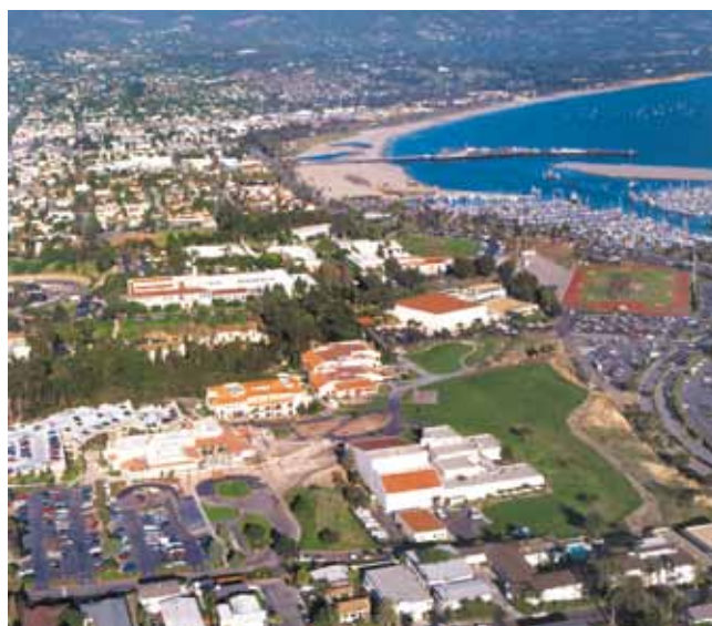
Kaplan International Center at Santa Barbara City College

Kaplan International Centers is a member of AAIEP (American Association of Intensive English Programs), TESOL (Teachers of English to Speakers of Other Languages) and NAFFSA (Association for International Educators).