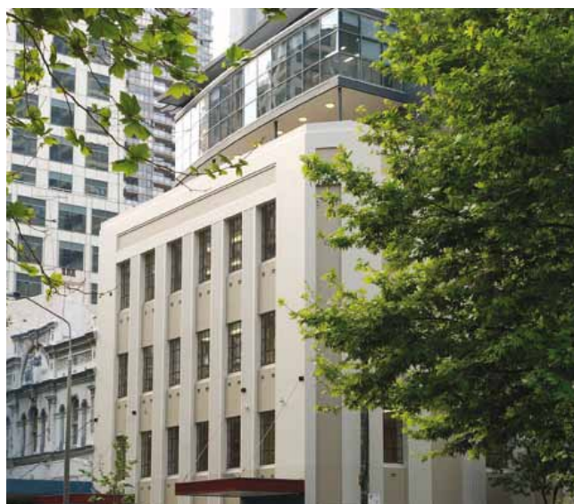
Kaplan International College Sydney City

For the perfect mix of stunning surroundings, offering beach life, a thriving cultural scene and the excitement of a vibrant metropolis - Sydney is the city to be in. At the end of a day of classes, sit back and drink a cappuccino at a harbour front café and when the weekend arrives, head for Bondi where 'Sydneysiders' soak up the sun and enjoy world-class surfing.