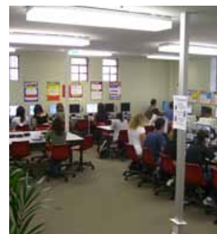
Study centre / library