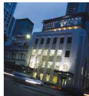
Kaplan International College Sydney City