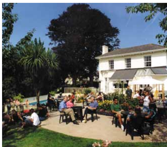
Kaplan International College in Torquay

Kaplan International College Torquay is a member of ENGLISH UK