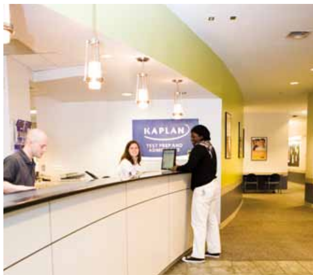
Kaplan International Center Washington DC reception

Reagan National Airport is conveniently connected to Washington, DC by Metro.