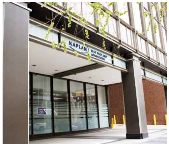
Kaplan International Center Washington, DC

The Washington, DC Kaplan center offers first-class modern facilities with an extensive library of self-study material to be used in the center. The self-study material includes access to the center’s video lab with over 25 TVs and DVD players, and to the computer labs with over 40 computers with free Internet and WiFi access for international students. Additionally, the DC center has an English Language lab with computers for students to practice the TOEFL iBT.