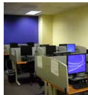
New computer lab