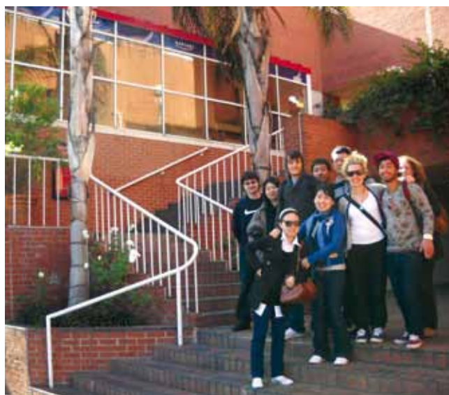
Kaplan International Center Los Angeles - Westwood

We encourage you to take full advantage of our excellent educational quality programs and the overall experience of studying and living in the United States. Many of the Westwood students use our University Placement Services and transfer to Santa Monica College, which has a high transfer rate to schools like UCLA and the University of Southern California (USC).