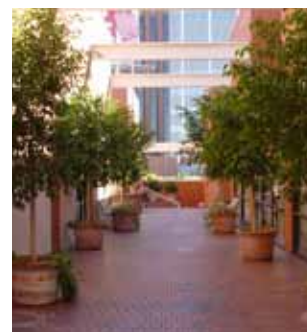
Kaplan center courtyard