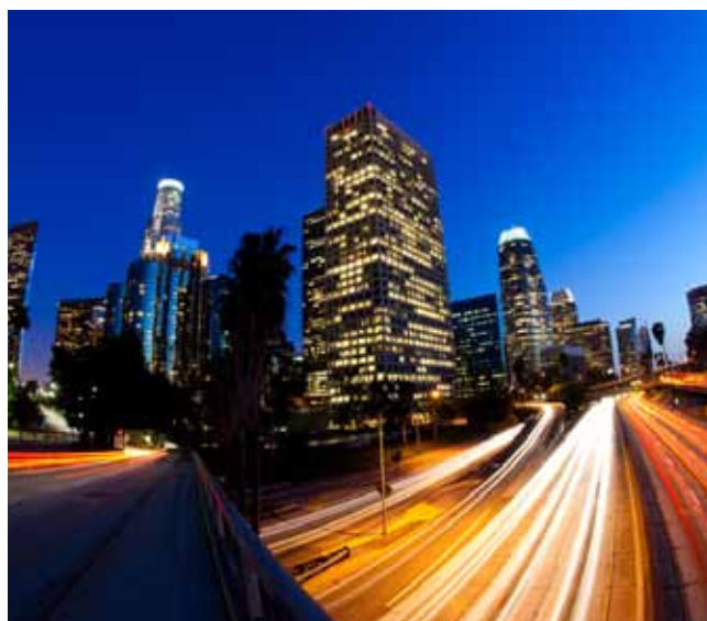
Los Angeles at night