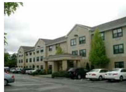
Exterior of the apartments