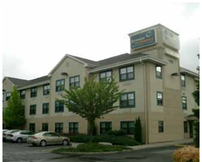
Front of the apartments

Extended Stay Apartment 1400 S. 320th St. Federal Way, WA 98003 USA