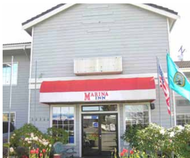
Marina Inn Student Residence

Marina Inn 22300 7 Ave S Des Moines WA 98198, USA