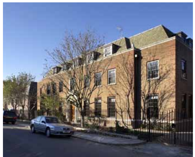
Liberty Fields residence

Liberty Fields 10 Halsmere Road Camberwell London SE5 9LN