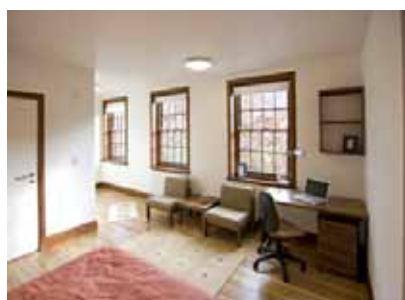
Studio study area