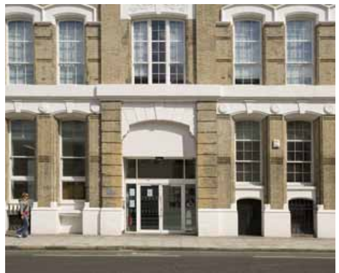
Liberty Living St. John Street Residence

Liberty Living 218 St. John Street London EC1V 4AT