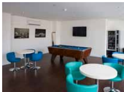
Student common room