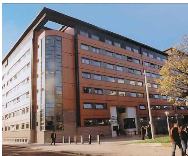
Liberty Living at Sir Charles Grove Hall

Liberty Living Sir Charles Grove Hall Booth Street West Manchester M15 6PF