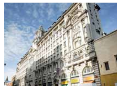
The college - just a 10-minute walk from the residence