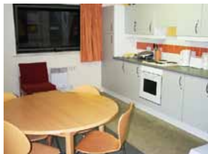
Shared kitchen/dining area