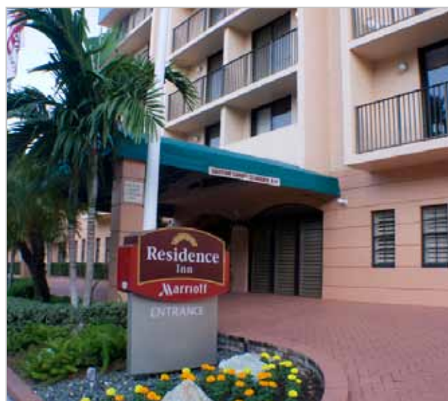
Residence Inn by Marriott