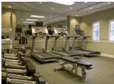
Marriott fitness center