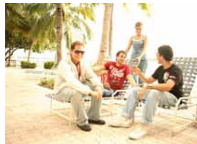
Enjoy easy access to Miami's beaches, restaurants, shops and nightlife