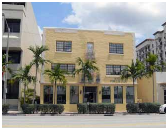
Ponce De Leon Hotel