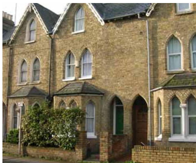
One of the St. Clements Apartments

Meeting address for arrival at St. Clements Apartments: 47 St. Clements Oxford OX4 1AG