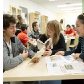
Study Centre / library