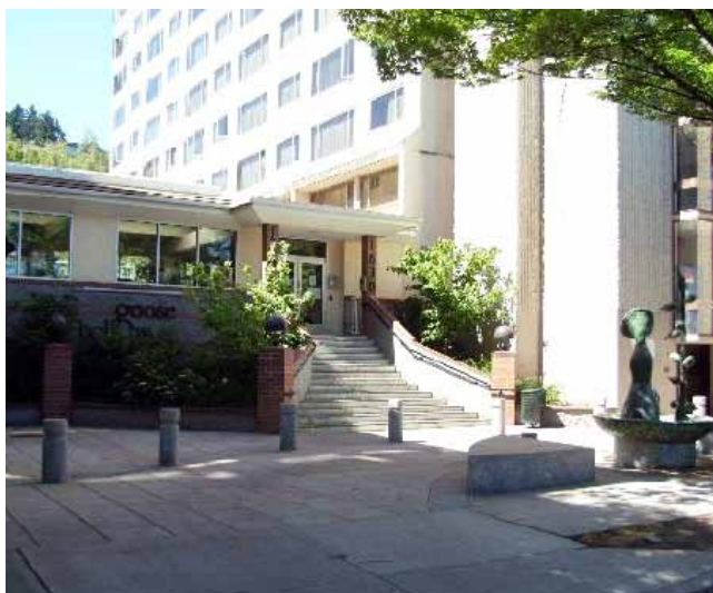
Goose Hollow Tower