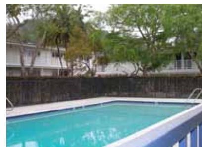
La Brezza swimming pool