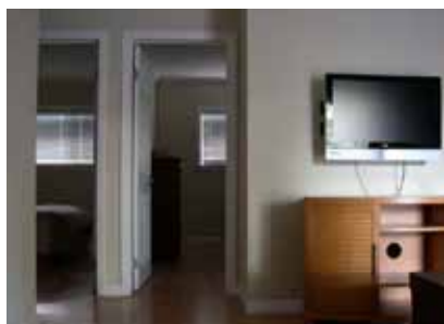
La Brezza interior