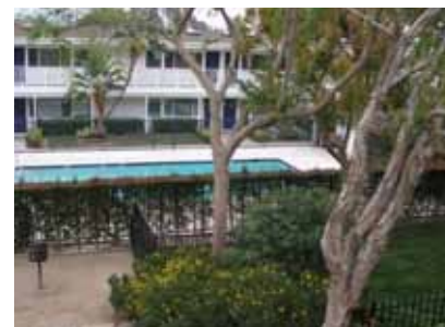
La Brezza exterior