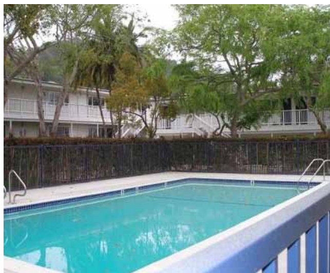
Swimming pool at La Brezza

La Brezza 620 West Gutierrez Street, Santa Barbara, CA 93101 USA