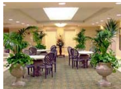
Mediterranean Inn lobby