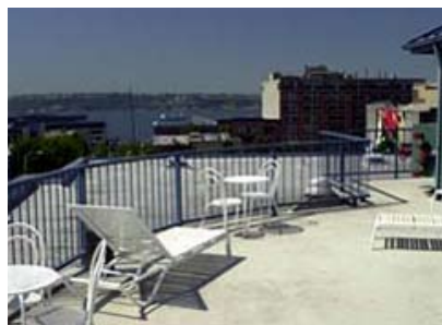
Belltown Inn public deck