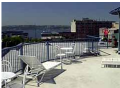
Belltown Inn public deck