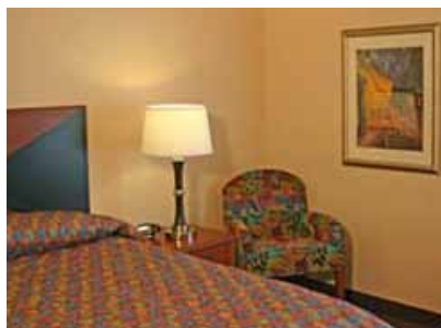
Belltown Inn room