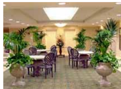
Mediterranean Inn lobby