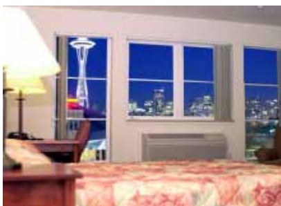
Mediterranean Inn room