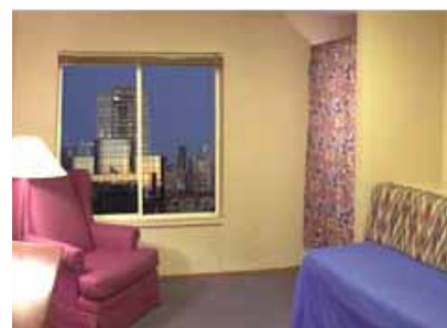
Vermont Inn room