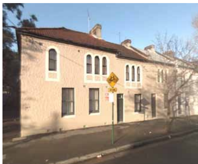
Sydney City Apartments