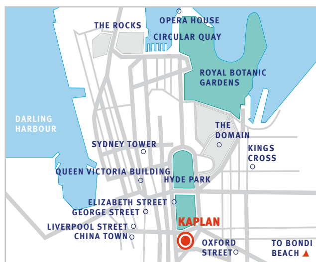
Sydney City Apartments 147 – 149 Foveaux Street Surry Hills Sydney NSW 2010

The European-style apartments offer Kaplan International College Sydney City students an opportunity to experience flat sharing with 4 to 5 other students. Every apartment has a private kitchen, common living area and bathroom, which is a short walk from the City Hostel, where guests are encouraged to join the weekly student activities coordinated by the hostel.