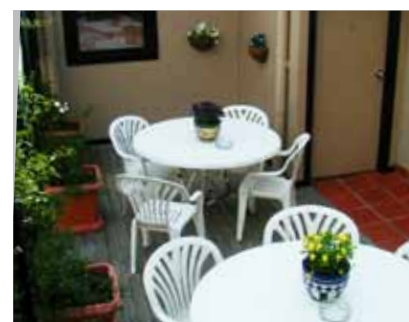
Outdoor patio area