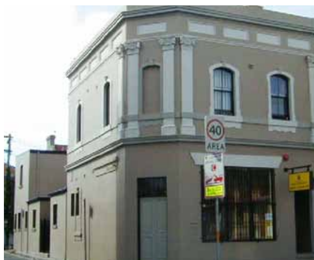
City Hostel exterior

510 Cleveland Street Surry Hills, NSW 2010 Australia