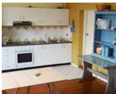
Kitchen / Common area