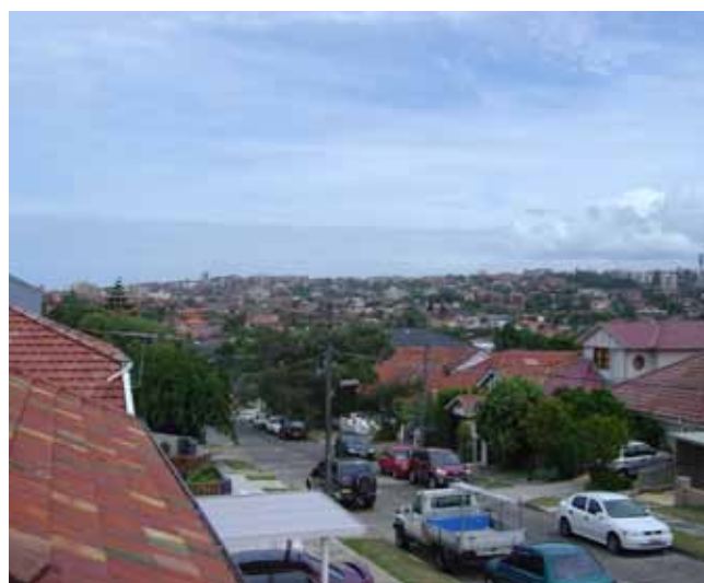
North Bondi Apartment view