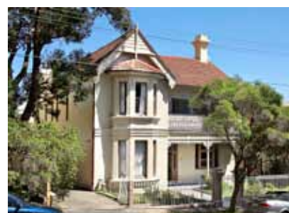
Paul Street Hostel