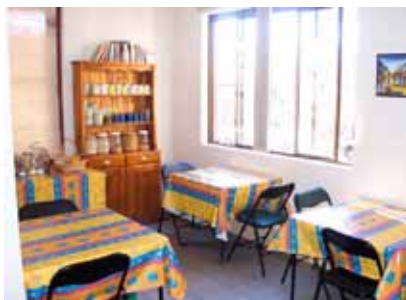
Bondi breakfast room