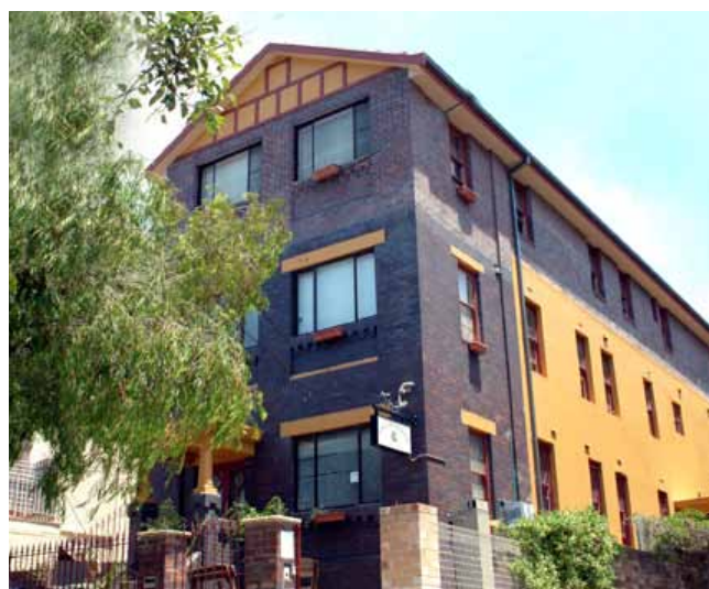
Bennett Street Hostel