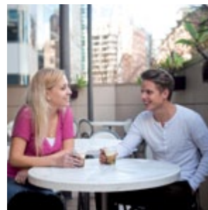
Cafe / balcony