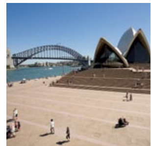
Harbour Bridge and Opera House