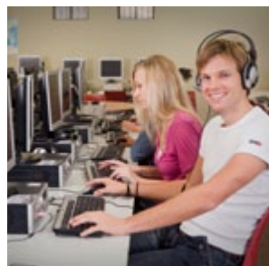
Study centre / library