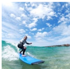
English plus Surfing