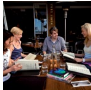
Cafés and restaurants