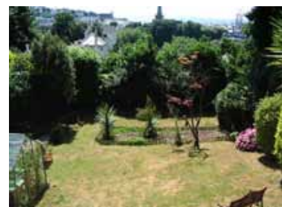
Private walled garden