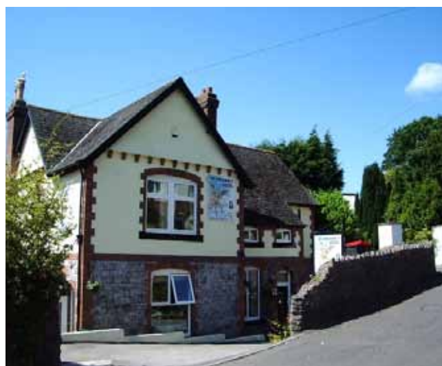
St Michael's Residence