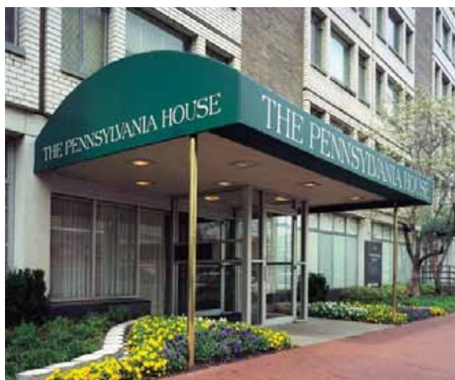
Pennsylvania House main entrance

2424 Pennsylvania Avenue, NW Washington, DC 20037 USA