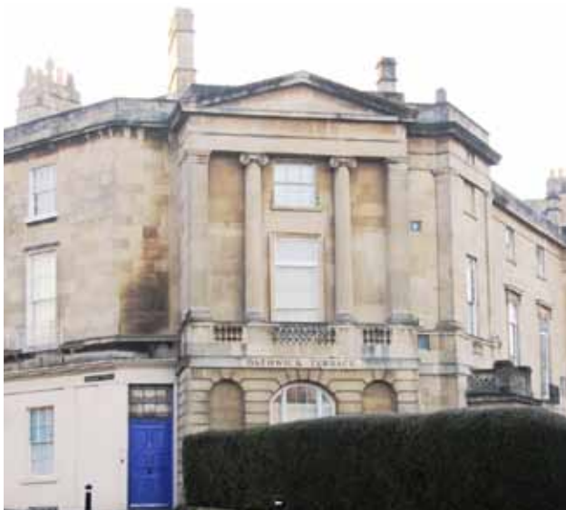
5 George's Place

A £200 deposit is payable by credit card on arrival at the school.