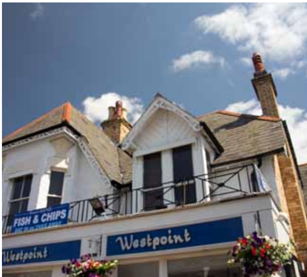
Sea Loft Apartments

Kaplan International College is within 25 minutes walk. There are also regular bus services on a direct route to Westbourne from Bournemouth Centre.