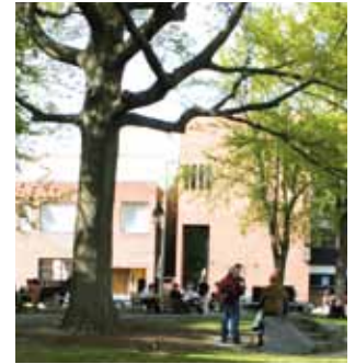
Kaplan International Center