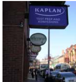
Harvard Square School Entrance

There is a wide choice of activities available to students that come to study at our Harvard Square center. Popular activities include weekend trips to New York City, ski resorts, beaches, outlet shopping malls, tours of Harvard University and MIT campus, tours of the Museum of Fine Arts, Institute of Contemporary Art, Museum of Science and New England Aquarium, free festivals, free lectures by MIT and Harvard professors and scholars, and outdoor concerts.