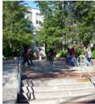
Northeastern University campus

There is free wireless internet access on campus, and the Starbucks café on campus also offers Wi-Fi.