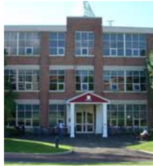
Ryder Hall, where the Kaplan center is located

Marino Center: basketball court, suspended track, exercise machines. Please note that not all fitness facilities are available to students under the age of 18. Students who are younger than 18 will be provided with compensation. Please ask the Center Director for details.