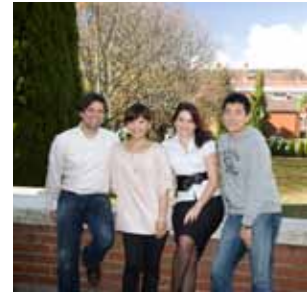
Study in beautiful surroundings