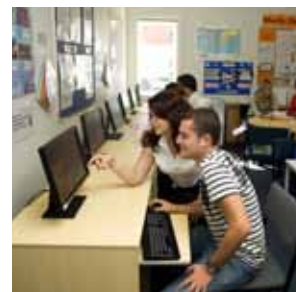
Study centre / library