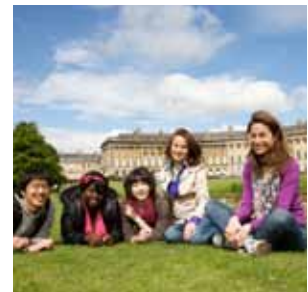
The Royal Crescent