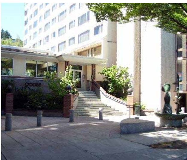
Goose Hollow Tower

Goose Hollow residents live in a true student environment. All residents attend one of the various schools in the Portland area. Kaplan students will enjoy meeting students from across the USA and the world. For students interested in making friends in the USA, this residence is ideal.