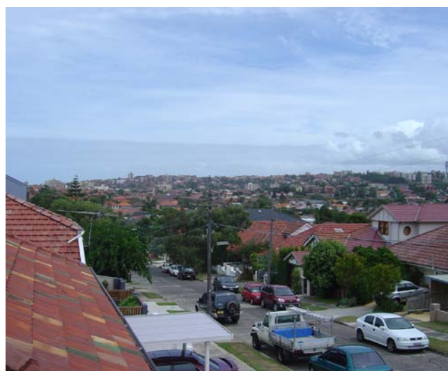
North Bondi Apartment view