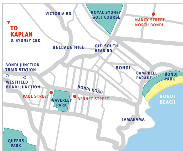
North Bondi Apartments 53 Nancy Street North Bondi NSW 2026 Sydney

North Bondi Apartments provide a private, independent, fully furnished student accommodation option in a quiet location. Each apartment has its own fully equipped kitchen and bathroom as well as a sunny back garden with lawn, and front balcony with seating.