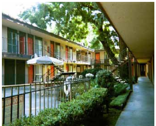
Outside the apartments

Warren Oaks 2430 Fair Oaks Blvd. Sacramento, CA 95825 USA