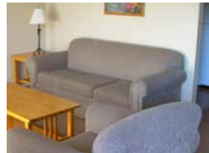
One bedroom apartment - living room