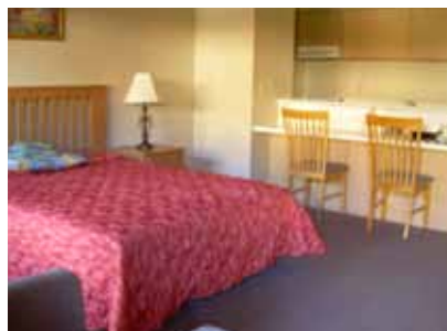
Studio apartment sleeping/living area