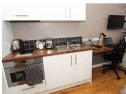
Fully equipped kitchenette