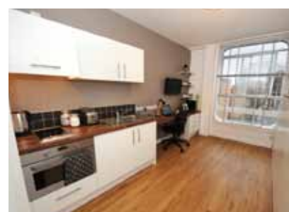
Kitchenette and study desk