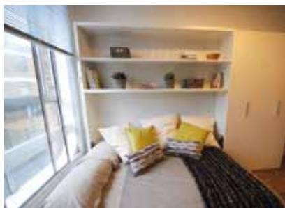
Studio apartment with folding bed