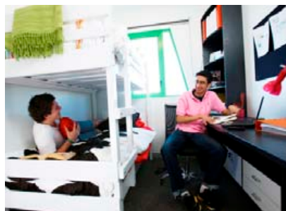
Shared (double) bedroom in a shared apartment