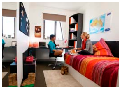
Single (standard) bedroom in a shared apartment