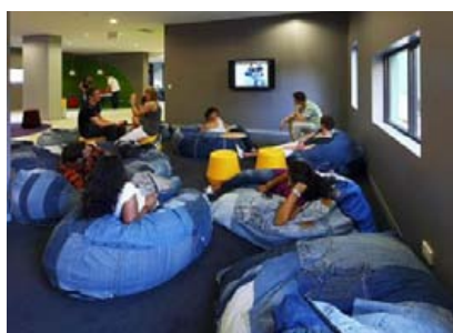
Shared Lounge/TV area