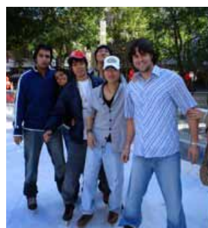
Kaplan students ice skating