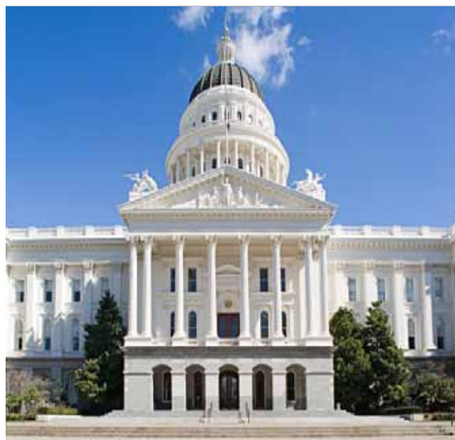
California State Capitol