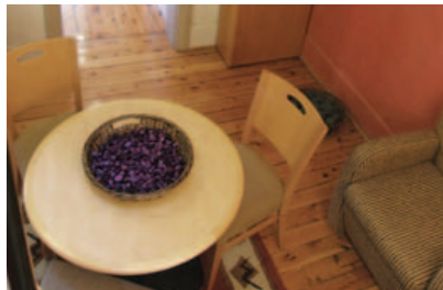
Living / dining area