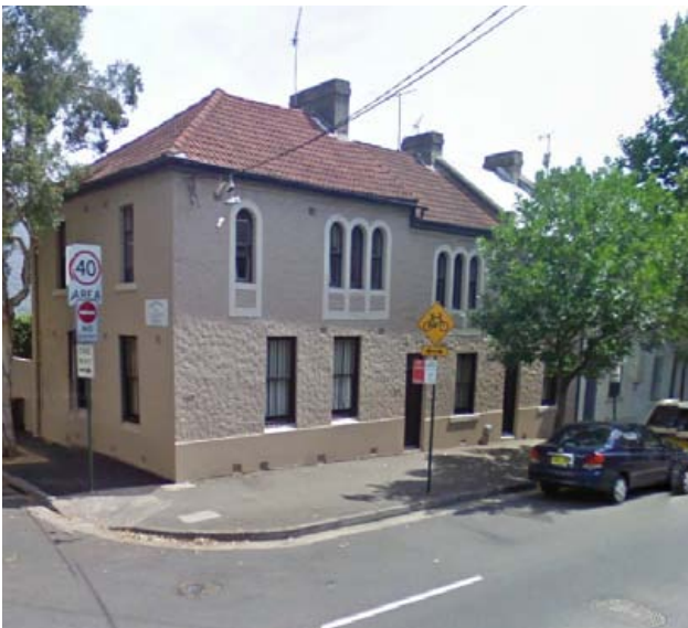
Sydney City Apartments

The European-style apartments offer Kaplan International College Sydney City students an opportunity to experience flat sharing with 4 to 5 other students. Every apartment has a fully-equipped kitchen, common living area and shared bathroom.