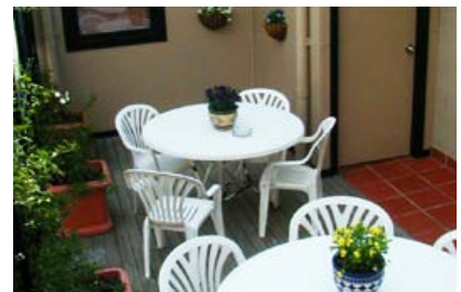
Outdoor patio area