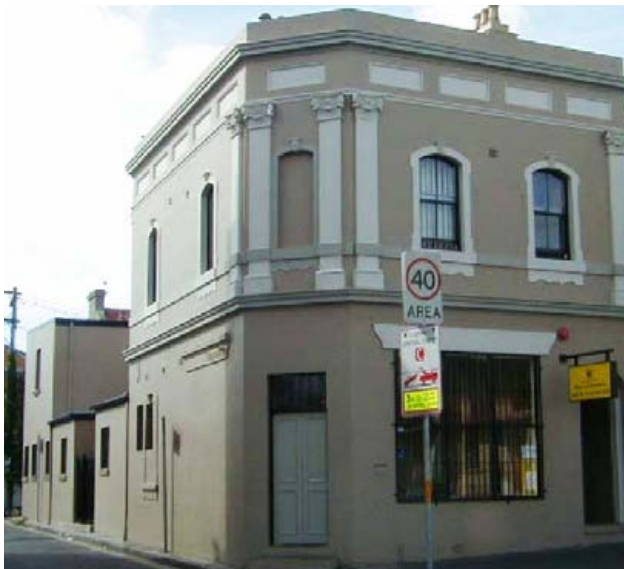
City Hostel Exterior

The City hostel offers single, twin and double rooms, a fully equipped kitchen/ common area with TV/DVD and a sunny balcony area. The hostel has shared facilities providing guests a great opportunity to socialise. Other facilities include internet, public telephone, games, tourism information and books.