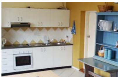
Kitchen / Common room