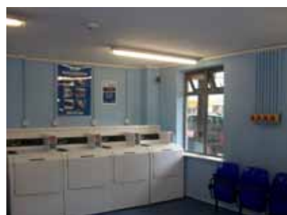
On-site laundry facilities