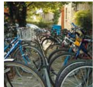
Bikes outside Kaplan International College