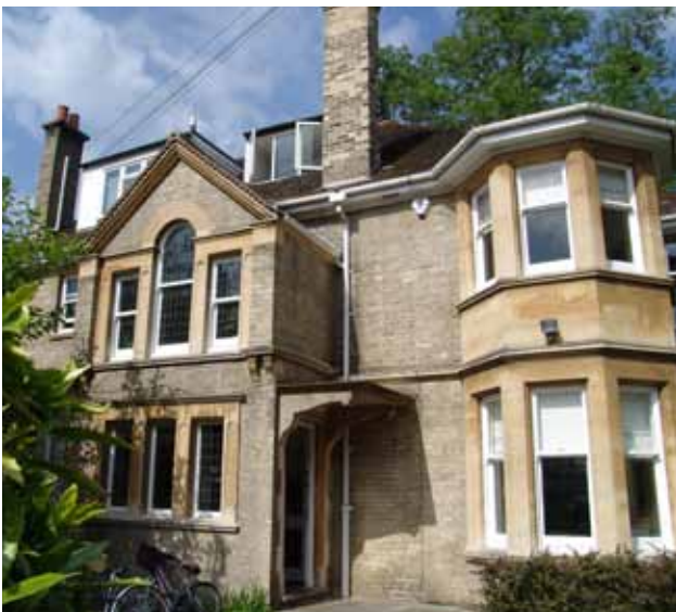
Kaplan International College Cambridge

Founded in the late 1970s, the college is housed in a large, converted Edwardian house with a modern extension. The college is west of the city centre in the quiet, residential area of Newnham, a 10-minute bus ride away from the centre. The college has its own gardens where we hold barbecues on warm summer evenings.