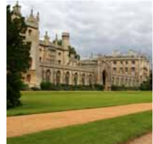
The University of Cambridge - St. John's College