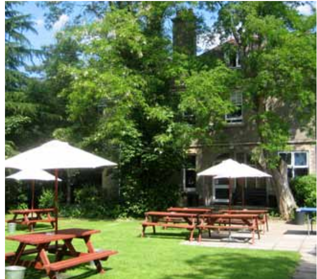
Picnic benches in the college garden

Trains to Cambridge depart from London Kings Cross station and London Liverpool Street every 30 minutes from 06.00 - 23.00. Journey time: 50 minutes. Tickets from Kings Cross cost £19.10 return (off peak) and tickets from Liverpool Street cost £9.60 return (off peak).