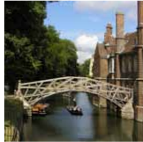
The Mathematical Bridge over the River Cam