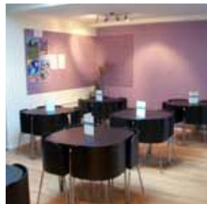
Kaplan International College coffee shop