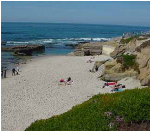
A beach scene

Kaplan San Diego is located about 10 minutes (walking) from the white, sandy beaches of La Jolla. The main streets, Girard, Pearl, Faye and Prospect have many shops, restaurants, museums and galleries.