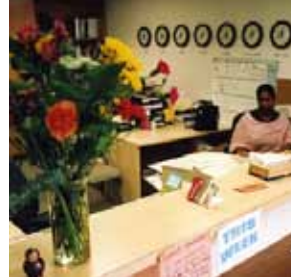
Front desk at Kaplan San Diego

Department stores are a 25 minute bus ride from the center. The closest supermarket is approximately a 5 minute walk away.