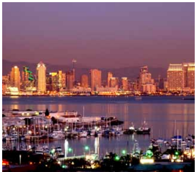
San Diego at night

Taxi – approximately $35-$65 (+ 15% gratuity)