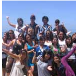
Kaplan San Diego students

Kaplan plans a busy schedule of activities each month including weekend trips to San Francisco, Las Vegas and Los Angeles. There are also days at Sea World and the famous San Diego Zoo. Additional activities may include beach days, museum visits and outdoor sports.