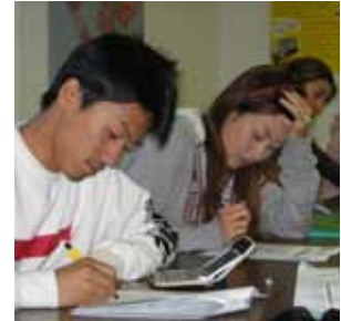
kaplan San Diego classroom