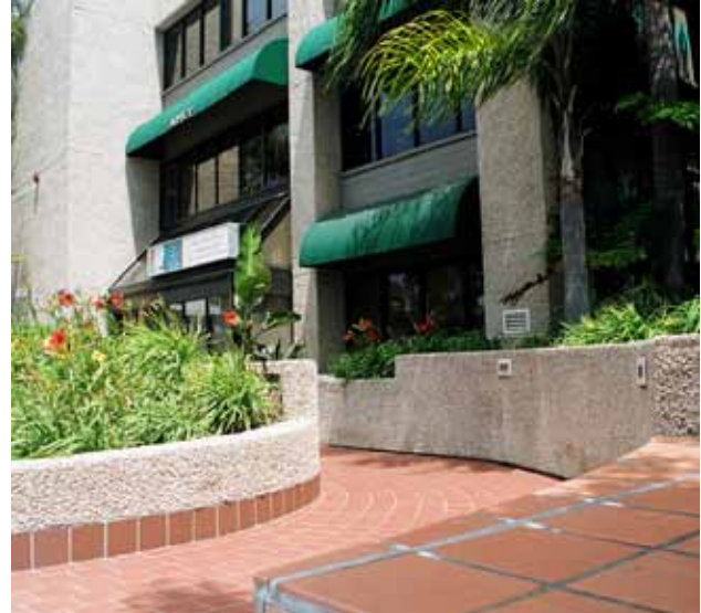
Kaplan International Center San Diego

If you have any flight changes, miss a connecting flight, or need help meeting the Transfer Service, you should call the center's emergency number at +1-858-551-5750 for help, and be prepared to tell them your name, center name (Kaplan San Diego) and new flight details.