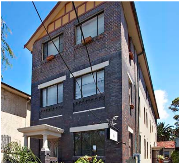
Bennett Street Hostel

Communal areas include a dining-room, a large outdoor terrace with free BBQ for residents to use before 10:30pm and kitchen facilities before 9:30pm. Other facilities include a washing machine, tourist brochures, internet, books and games.