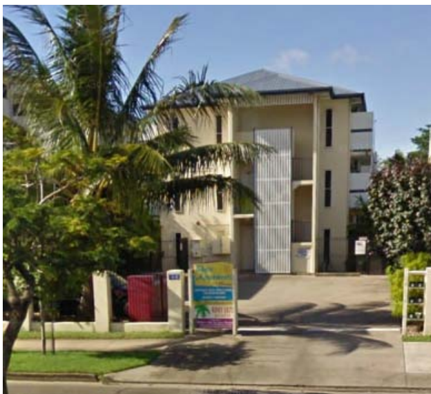
Cairns Sharehouse - Martyn Street

Meet new people and make life long friends from all over the globe as soon as you arrive in Cairns!