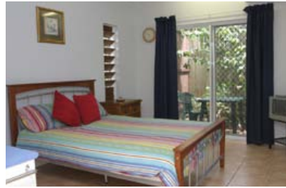
Double room / private balcony