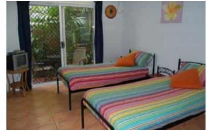
Twin bedroom / private balcony