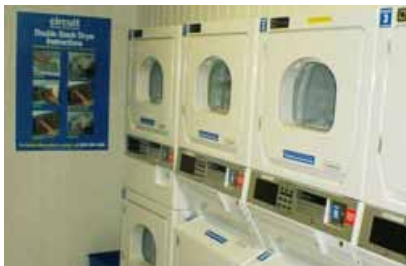
On-site laundry facility