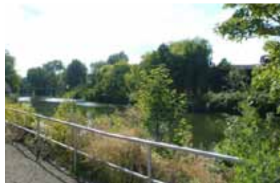
Waterside Court is located next to the River Avon