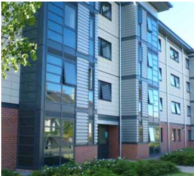
Waterside Court Residence

Waterside Court has a main office which is manned 24/7 by either residence or security staff. In addition there is CCTV surveillance, a large common room with TV and several sofas, a central courtyard and a coin-operated laundry facility shared between all residents.