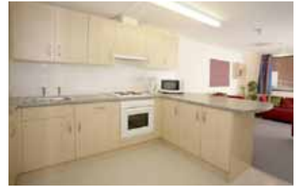
Communal kitchen/lounge area