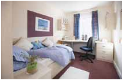
Single study bedroom