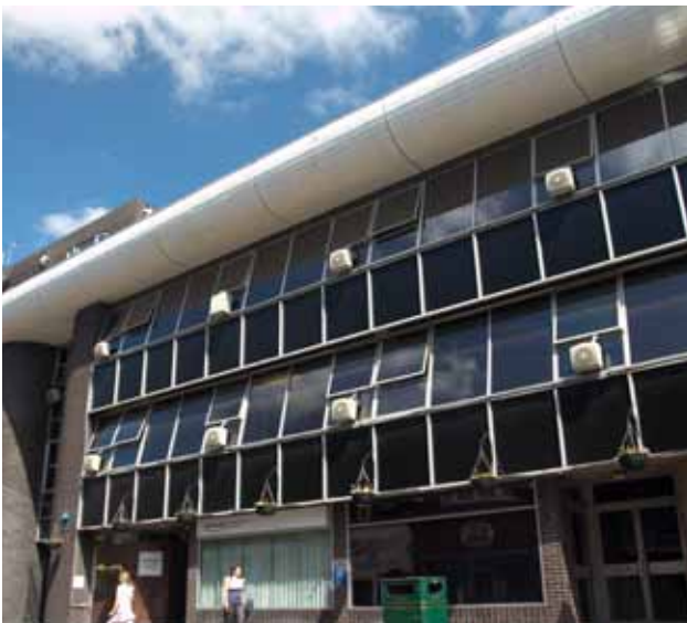
Kaplan International College Bournemouth

Purbeck house is ideal for students who like more independence, who want to cater for themselves.