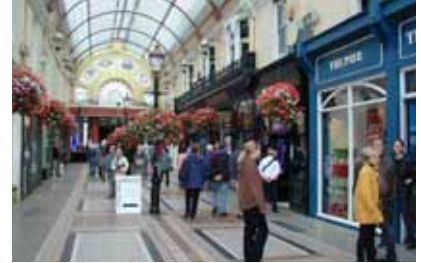
Bournemouth town centre is just a 5 minute walk from the residence