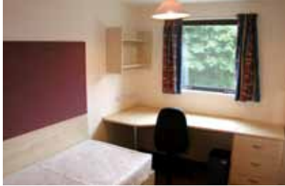
En-suite bedroom with study desk