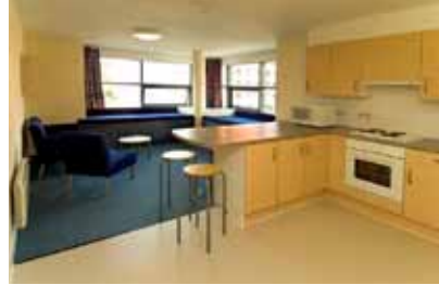
Shared lounge and kitchen