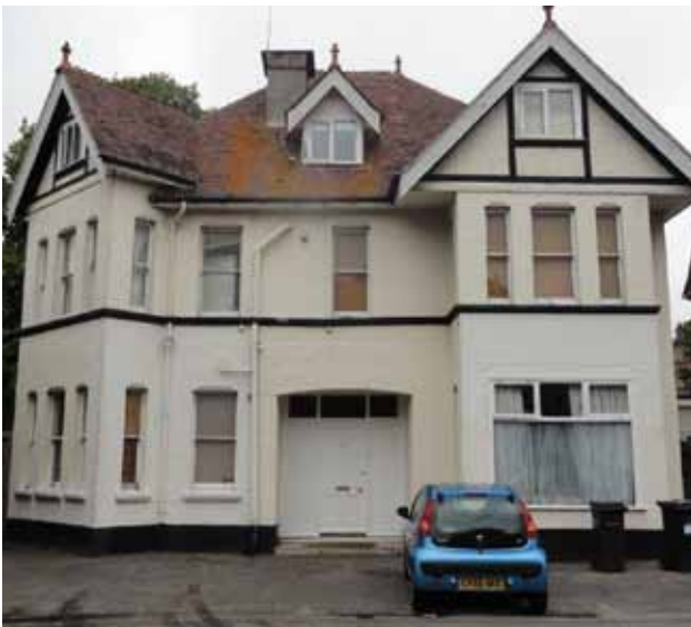
The Fern Apartments

Regular bus services take students to Bournemouth and Poole town centres where there is a great choice of restaurants, bars and nightclubs, as well amenities such as banks, shops, coffee bars and a post office.